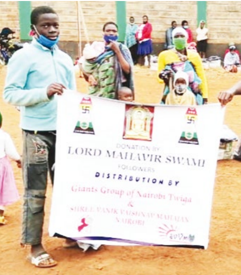
Lord Mahavir Swami followers donated rations packs and blankets to 77 persons with special needs ( physically challenged and leprosy) in Karogochu The distribution was done by Giants Group Twiga and Vanik Vaishnav Mahajan The receipants thanked the three institutions for their timely support